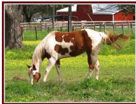
Hooves and legs hidden in grass.