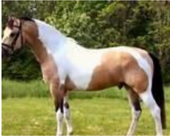
Nose and/or hooves cut off.