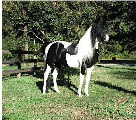
Too much back ground.