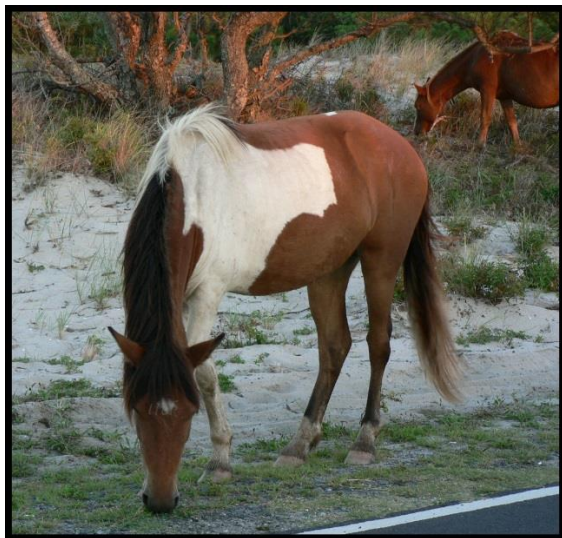
Horses head down eating.