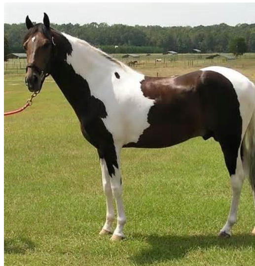
Tail and /or back leg cut off.